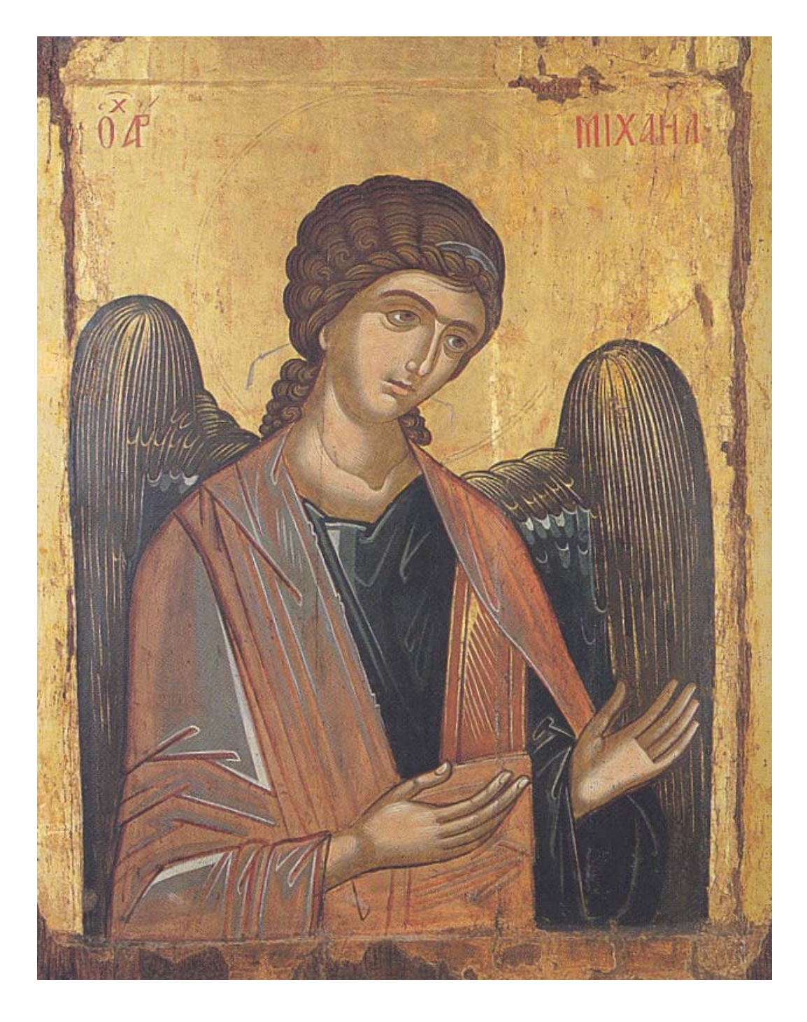
FRIENDS OF THE HELLENIC INSTITUTE NEWSLETTER 2009